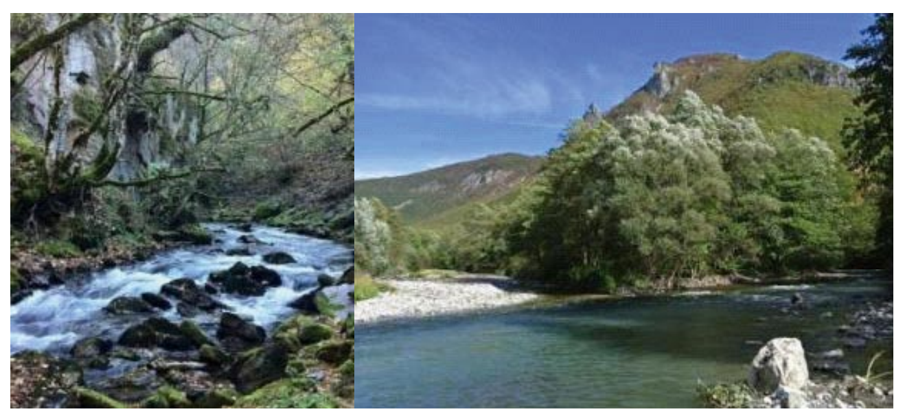
HPP Boskov Most: two rivers that would be affected by drainage and daily flush, the Mala River (left) and Radika River (right).

The dam project Boskov Most is located in the upper Mala Reka valley in the southernmost part of the national park. The main source of funding for this dam project is the EBRD - the European Bank for Reconstruction and Development. The HPP is designed to produce peak energy. For that purpose the discharge of Mala River as well as its two major tributaries and several smaller streams in the area will be diverted into a reservoir via pipes and canals. On demand, the water will be released once a day. This will mean daily flushes, which have enormous negative impacts on biodiversity and species populations in the river sections below the power-house - and all this in a national park. Furthermore, riverine ecology of the entire valley will severely suffer from the diversion of the majority of its natural water supplies.