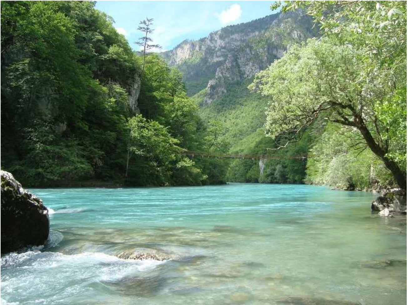
Tara River (ME). The river is threatened by 8 projected hydropower plants.