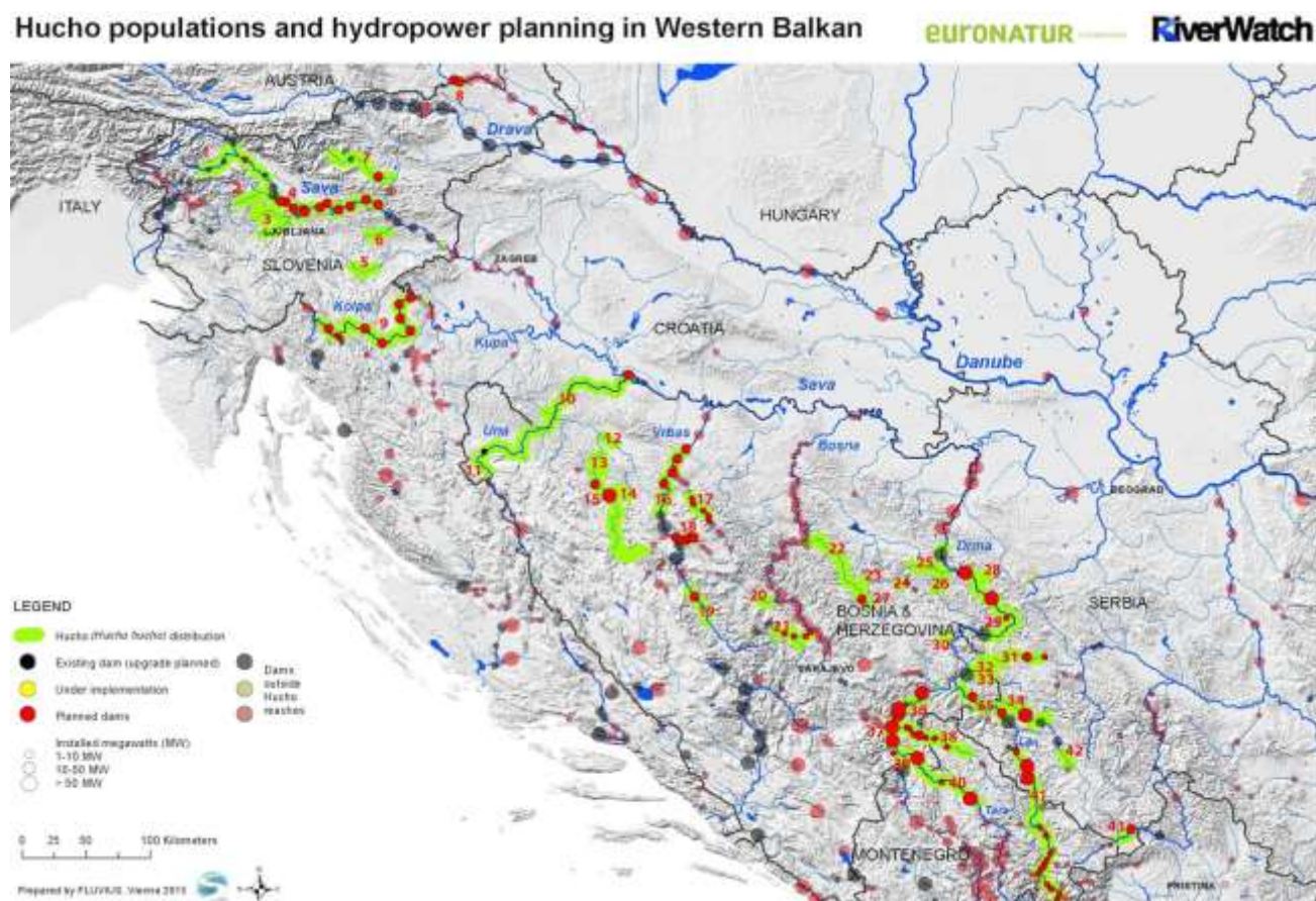
Figure 2. Distribution of self-sustaining Huchen populations and existing as well as potential future hydropower plants in the Balkan region. Numbers correspond to Table 1.

All major river reaches characterized here as Huchen habitat are under direct threat of destruction or the negative effects of hydropower expansion. Table 3 as well as Tables 4-6 in the Appendix provides an overview on the planned hydropower dams within the Balkan distribution area of Huchen. If these dams were constructed, at least 1.000 km of Huchen habitat would be drowned by reservoirs or severely degraded by hydropeaking below the dams.