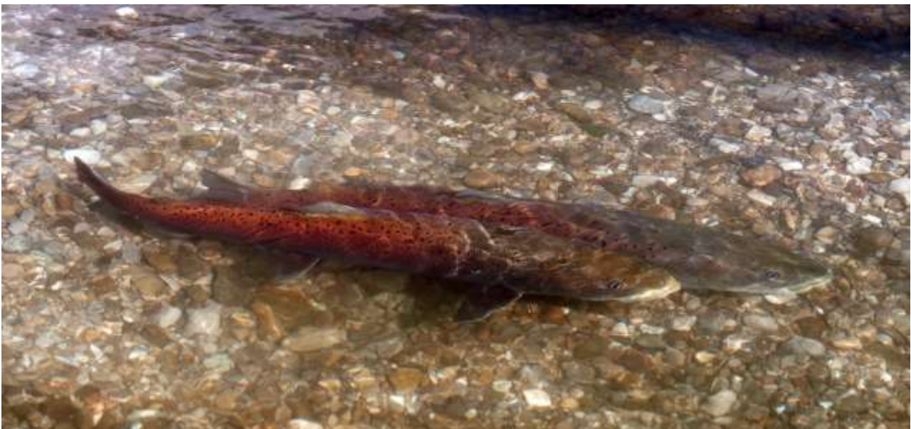
A pair of spawning Huchen © Clemens Ratschan

Holčík et al. (1988) and Witkowski et al. (2013) point out that Huchen is highly sensitive to various human impacts and is a good indicator for river health. Huchen is sensitive to low oxygen and moderate levels of pollution. Their large size makes them a target of both legal and illegal fisheries and as a large apex predator, healthy Huchen populations need considerable space and available prey. As Huchen prefer relatively low water temperatures, they are also sensitive to climate change (Ratschan, 2014).