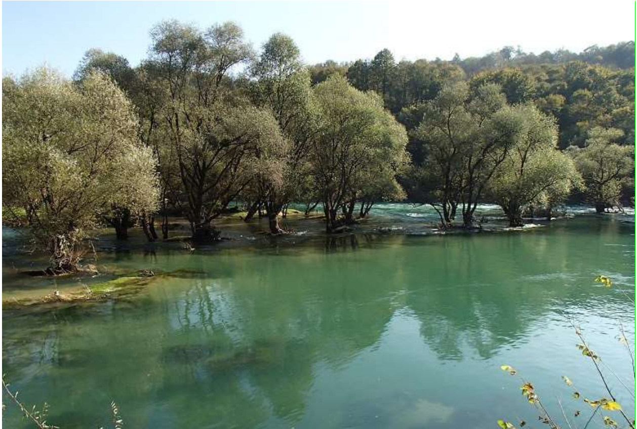
Una River (HR/BIH)

Additionally, except for the Una River in Bosnia-Herzegovina where only limited hydropower development is foreseen, each country's core Huchen habitat is threatened in its entirety by hydropower exploitation (Table 3). By country, nearly all of Slovenia's Huchen habitat, and all of Montenegro's Huchen habitat is threatened by planned hydropower expansion and the very last Huchen population in the Zapadna Morava drainage will be lost.