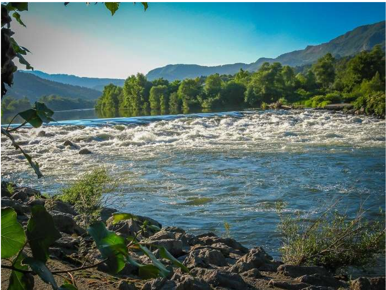
Sava River near Litija (SLO)

In general, we consider stocking to be not only an inadequate tool to manage or conserve natural populations of Huchen, but an action that all-to-often causes more harm than good in terms of genetic alterations, increased competition or predation pressure, and introduction of diseases. Reliance on large-scale stocking operations for management in systems where Huchen reproduce naturally is discouraged (see Ihut et al. 2014).