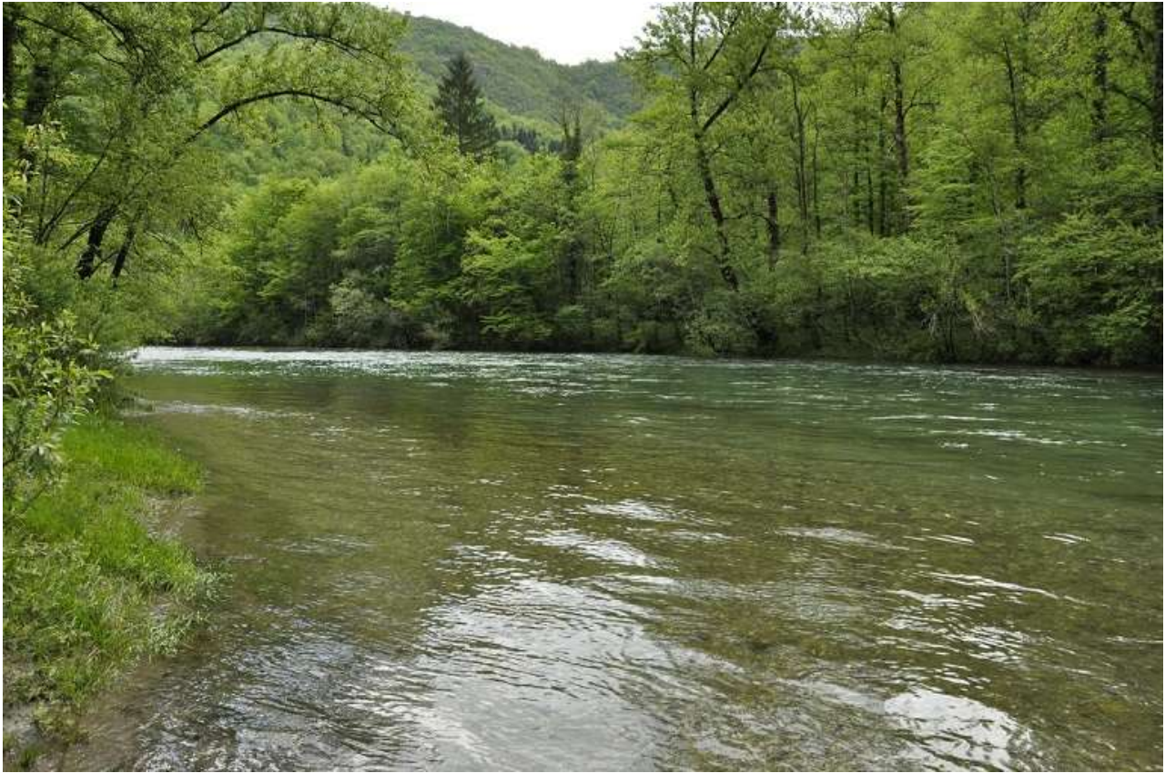
Kupa/Kolpa River (Slo/HR)