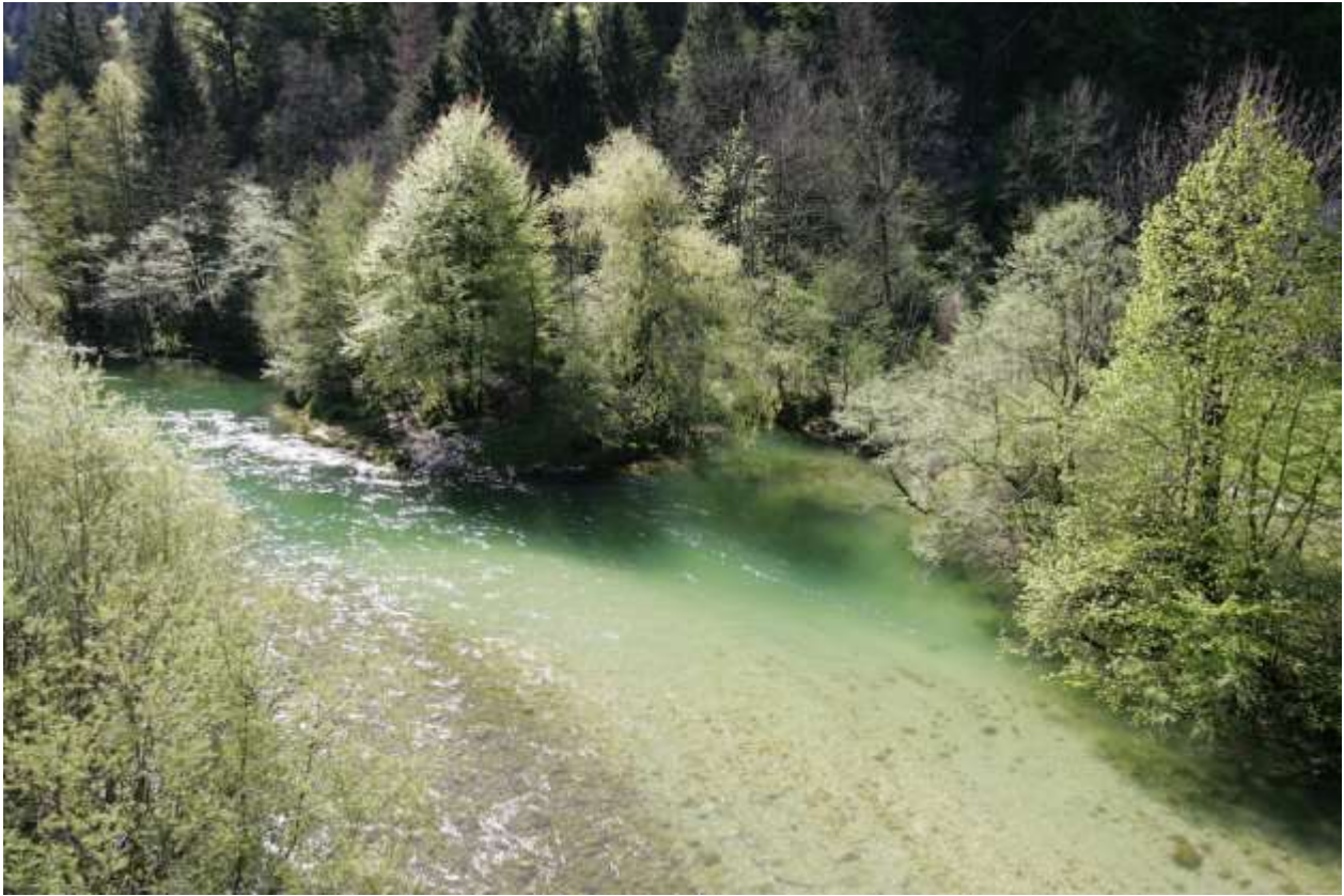
Sava Bohinjka (SLO)