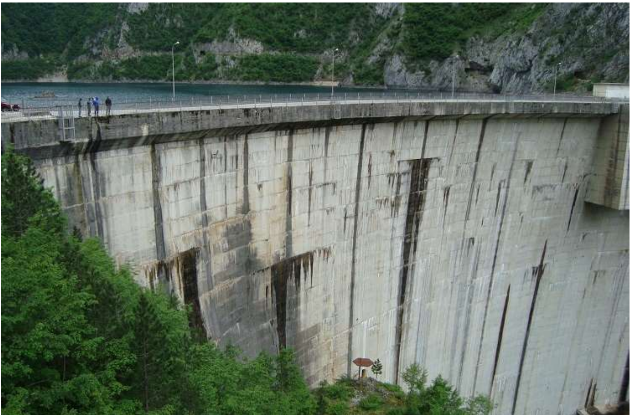
Dam on the Piva River (ME): destroyed Huchen habitat

All storage plant facilities are operated with at least some, and often a significant amount of hydropeaking. Hydropeaking is the fluctuating release of different volumes of water through turbines in order to meet fluctuating demands in energy use or to deal with too limited discharge of rivers for continuous power production. Hydropeaking is perhaps the most extensive (in area) and difficult to mitigate impact of storage or pump-storage hydropower schemes on riverine fauna. Fluctuating water levels of up to a meter or more are released (typically) daily or two times per day during peak demand. Few aquatic fauna can adapt to such conditions, and above all these fluctuating water levels severely degrade or eliminate reproduction or early-life history stages of many fish species. The larger the dam or the higher the hydropeaking, the more river kilometres are affected. For example, storage hydropower facilities in Switzerland severely degrade the long reaches of the upper Inn River in Austria across more than 100 km, creating conditions that have not only eliminated self-sustaining Huchen, but most of their associated fauna as well.