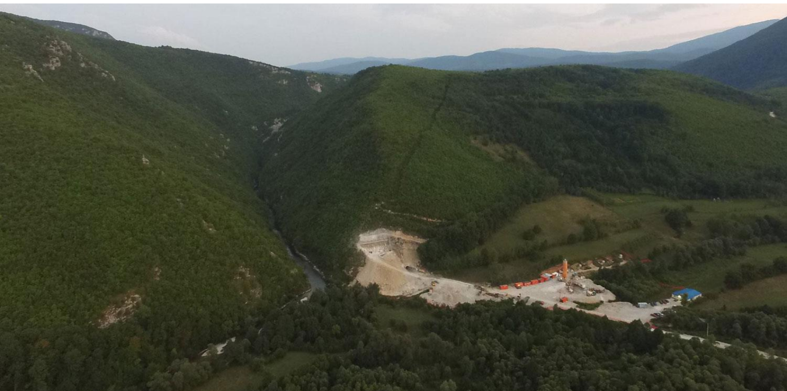
The controversial Medna Sana project built by Austria's Kelag group near the Sana springs in Bosnia and Herzegovina.

There are few companies with more than a few projects, but one company stands out: Energy Eastern Europe Hydro Power GmbH , owned by Wien Energie - Wienstrom GmbH; Energie-Zotter-Bau GmbH & CO KG and Fras Beteiligung und Beratung GmbH (Austria). It is involved in no less than 27 projects, of which 11 are in protected areas (see table on page 12).