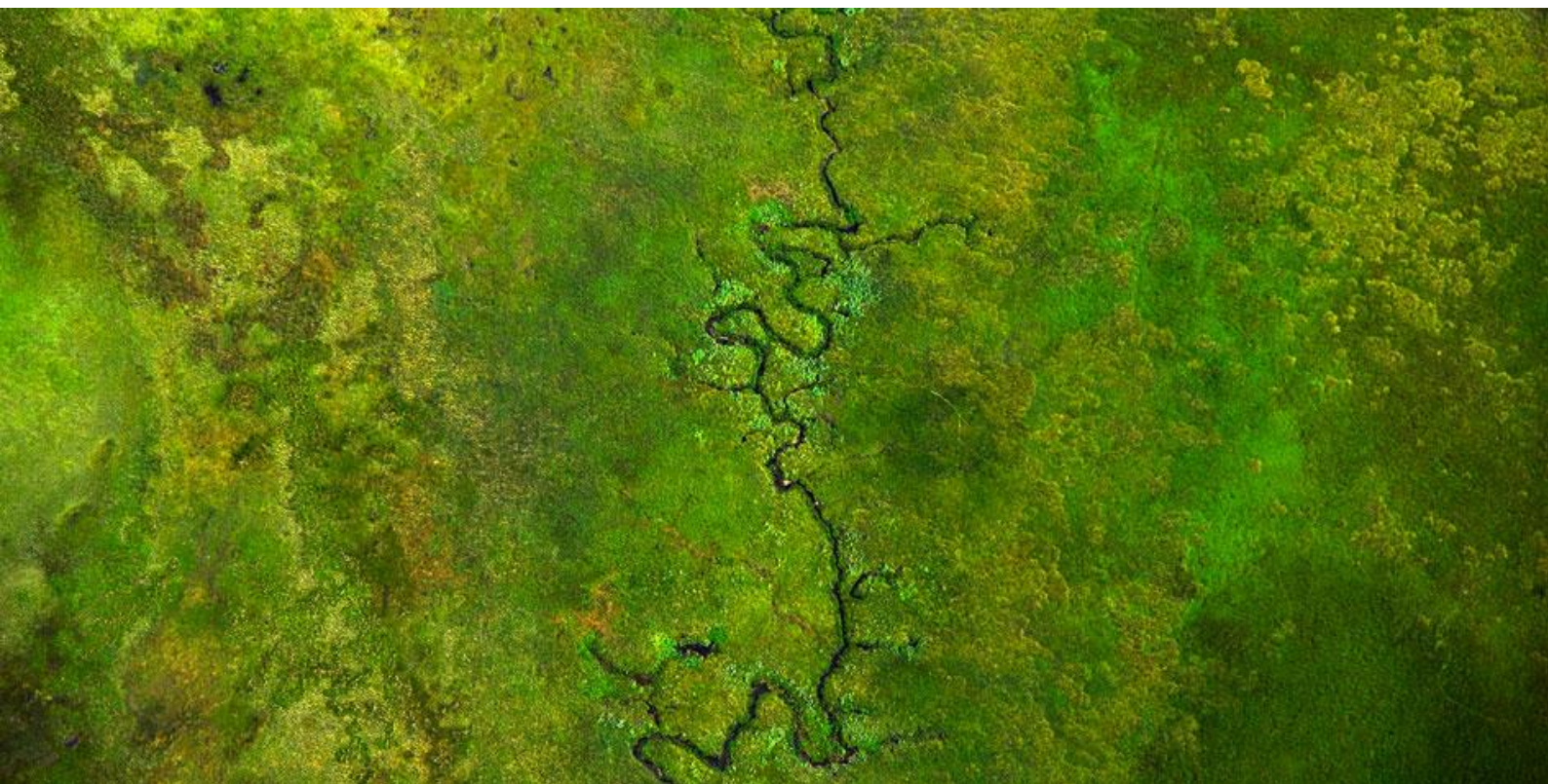
Lukovo Pole in the Mavrovo National Park, the site of a planned dam and small hydropower plant under consideration for financing by the World Bank.

EBRD has taken a lead in financing plants inside Macedonian protected areas such as Kamenicka in Osogovo mountains protected area, Trasonicka inside the Mavrovo National Park and Brajcinska inside the Pelister National Park. KfW is another international public financier for which protected areas have been no barrier when providing support for greenfield projects in Macedonia, including Patishka inside the Jakupica protected area.