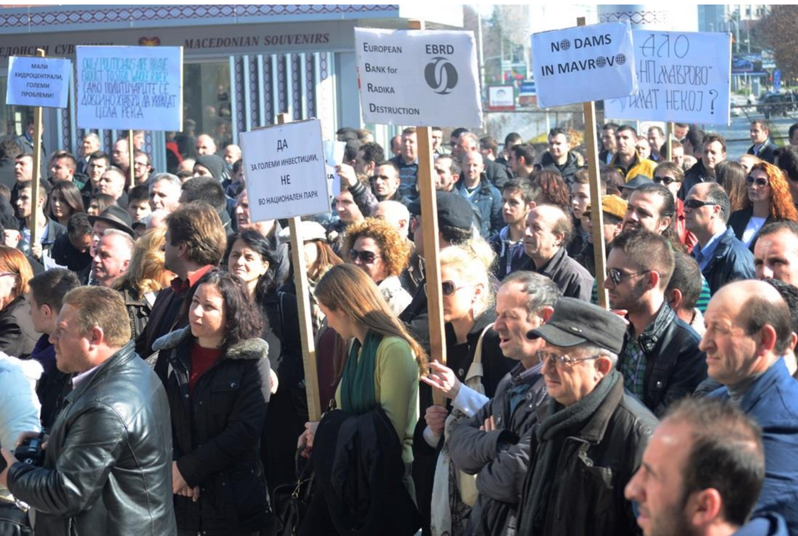
A community protest in Skopje, Macedonia in February 2014 against support by the World Bank and the European Bank for Reconstruction and Development for hydropower plants inside the Mavrovo National Park.

However the lack of inclusion of the Water Framework Directive and the Birds and Habitats Directives in the Energy Community acquis means that the Treaty does not so far ensure that the hydropower sector in the candidate countries has to live up to the standards required in the EU.