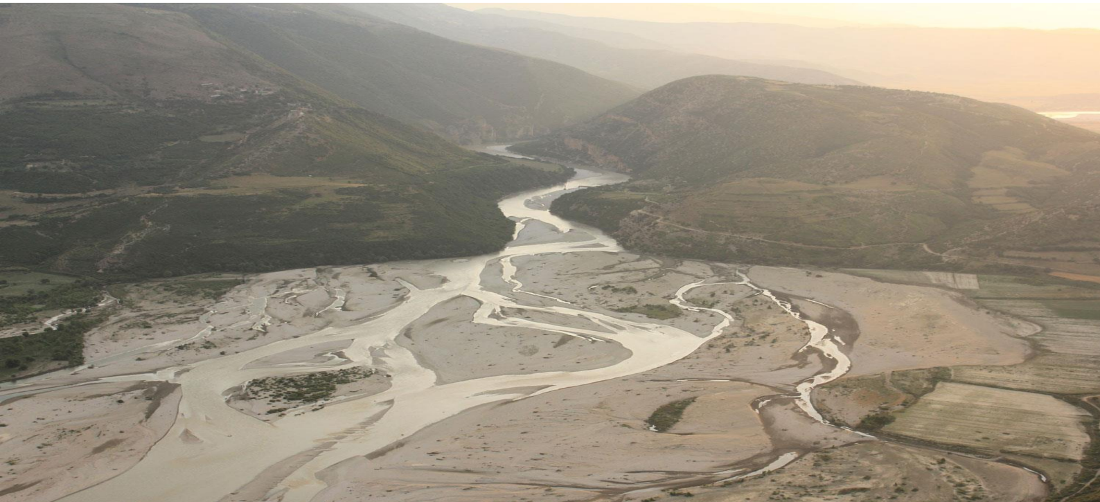
Albania's stunning Vjosa river. This section would be impounded if the Kalivac project goes ahead.