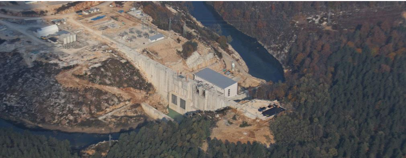
The Lesce hydropower plant on Croatia's river Dobra has caused numerous problems since its commissioning in 2010.