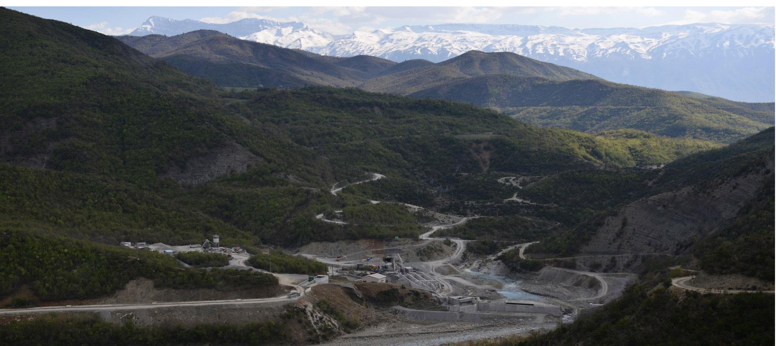
The Lengarica hydropower plant in Albania, financed by the IFC, Green for Growth Fund and Austrian Development Bank, contested for its biodiversity impacts.

The Norwegian export credit agency, GIEK, has not been confirmed to have backed any projects so far, but it has apparently agreed to provide money for a joint EUR 55 million fund with the Montenegrin Investment and Development Fund (IRF) to finance small hydropower projects.