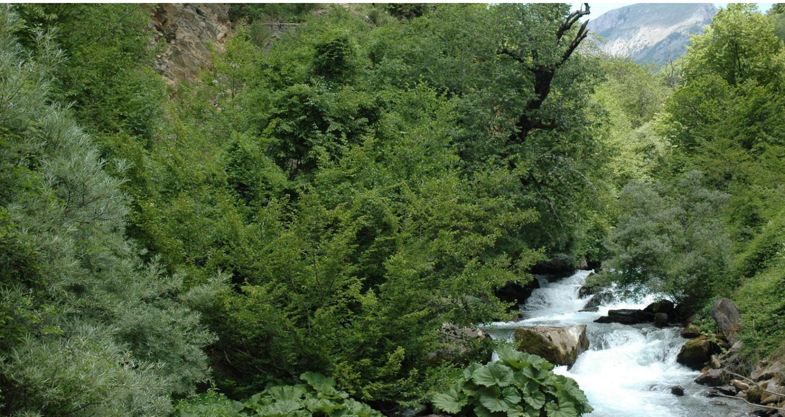
The Mala Reka river in the Mavrovo National Park where the EBRD has approved financing for the planned Boskov Most hydropower plant.

Inappropriate development of hydropower in southeast Europe is already attracting significant opposition, and unless serious action is taken this is only likely to intensify. Bulgaria has already suffered from a backlash against small hydropower plants due to environmental damage and a perception that high feed-in tariffs were going to politically well-connected people. In Albania a debate has started on a potential moratorium on small hydropower plant development. Such controversy is likely to spread to the rest of the region unless action is taken to stop unsuitable projects being developed at unsuitable locations.