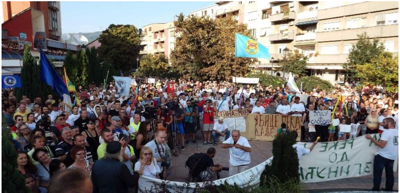
Protest in Pirot close to Stara Planina Nature Park, September 2018.

Stara Planina Protests. The number one environmental issue in Serbia is currently the construction of 60 hydropower plants in the Stara Planina Natural Park. Residents and people from all over Serbia are angry and have joined continuous protests. In early September, 3,000 people protested in Pirot against these plans. After a creek in the Nature Park was displaced without a permit to pave the way for the construction of a hydropower plant, residents of Pirot/Stara Planina took it into their own hands to successfully return their river to its original bed. VIDEO