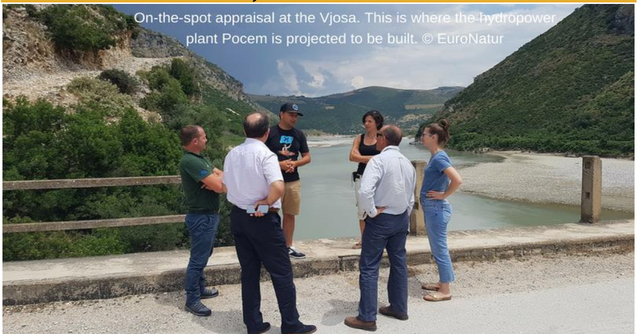
On-the-spot appraisal at the Vjosa. This is where the hydropower plant Poçem is projected to be built.

Bern Convention. Representatives of the Bern Convention visited the Vjosa in order to investigate to which extent the projected hydropower plants Kalivaç and Poçem are jeopardizing the objectives of the Bern Convention. As a result, recommendations to stop the construction of the two planned hydropower projects were made to the Albanian government. These recommendations are to be formally adopted at this year's meeting of the Standing Committee of the Bern Convention. MORE