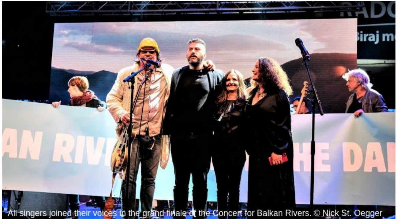
All singers joined their voices in the grand finale of the Concert for Balkan Rivers.