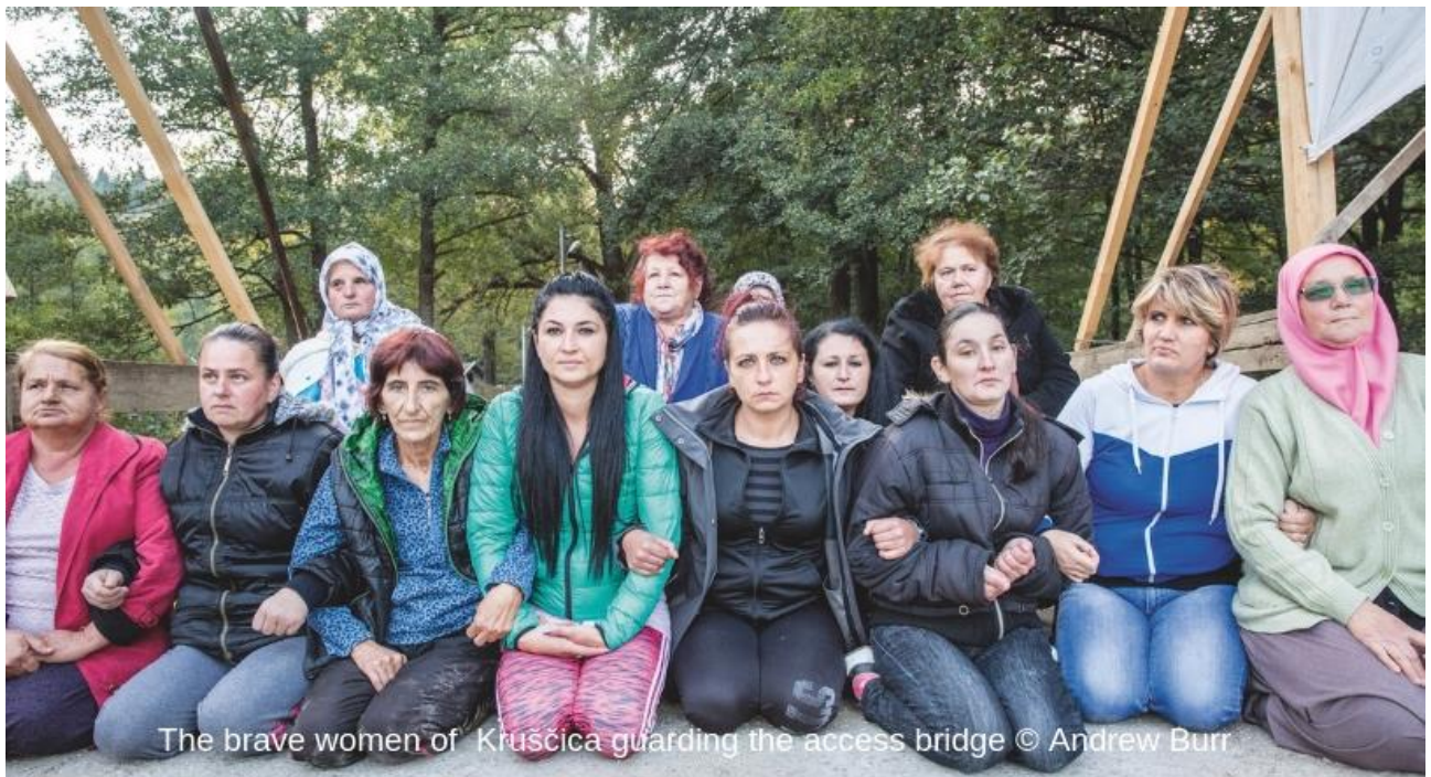
The brave women of Kruščica guarding the access bridge

The brave women of Kruščica. For over a year they have been occupying a bridge day and night to prevent the construction of two hydropower plants. They even resisted police violence. In June, a court overturned the construction licence , nevertheless the investor showed up with excavators in August. The unwavering women successfully fended off this violation! Before Christmas, judges are to make a final decision on whether the permits for the two hydropower projects are illegal. MORE