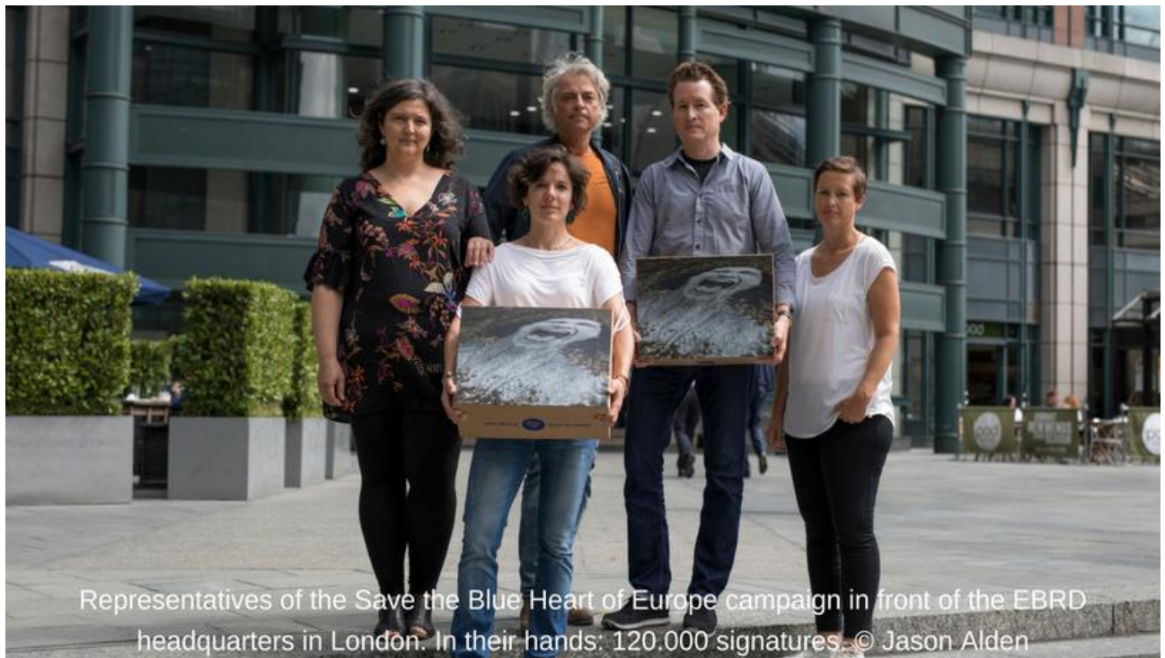
Representatives of the Save the Blue Heart of Europe campaign in front of the EBRD headquarters in London. In their hands: 120.000 signatures.