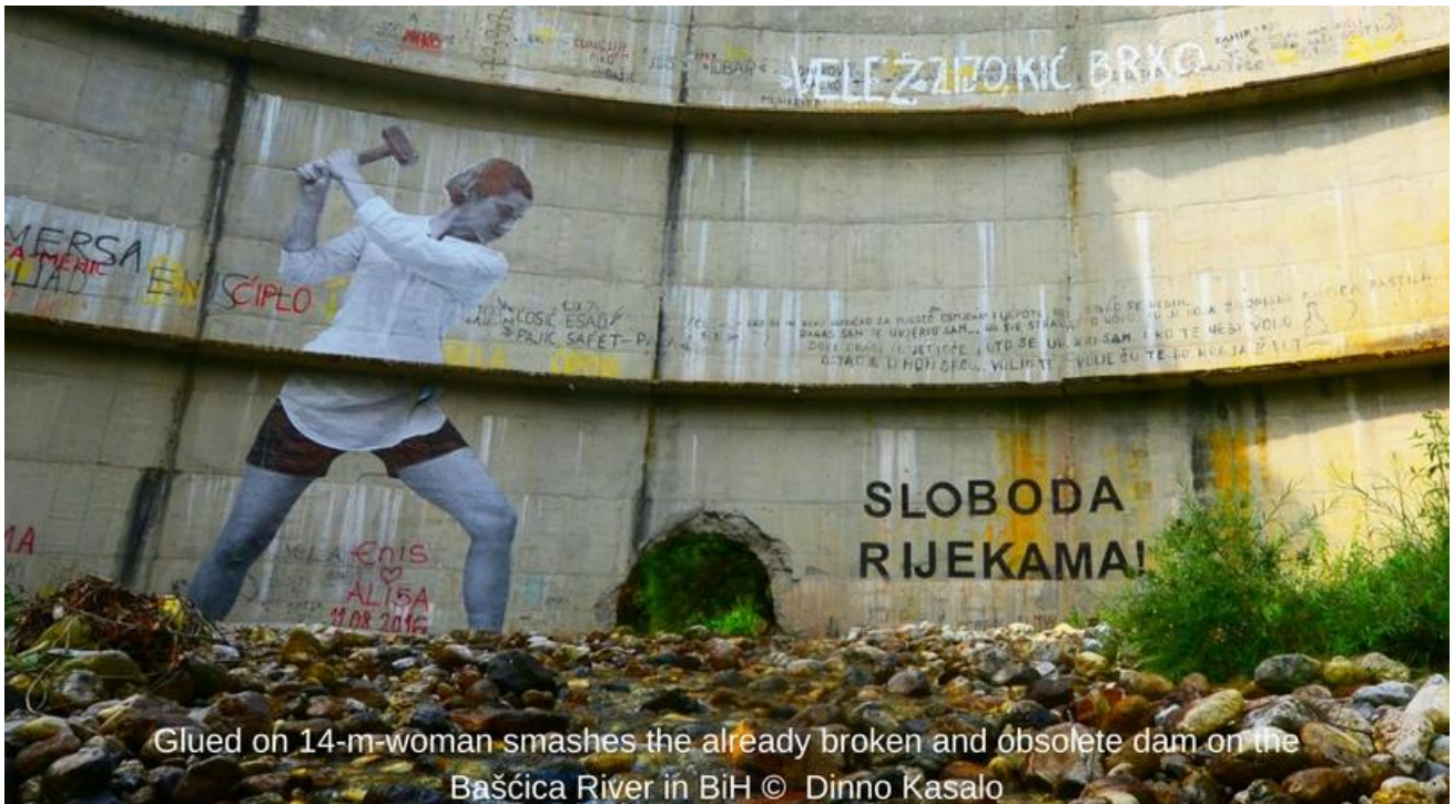
Glued on 14-m-woman smashes the already broken and obsolete dam on the Baščica River in BiH

Freedom to our rivers! The Center for Environment (CZZS) recently attracted international attention with a very special action: a 14-meter-woman is smashing an already broken and obsolete dam on the Baščica River in Bosnia and Herzegovina with a hammer. Furthermore, CZZS supports local initiatives in the fight for their river .