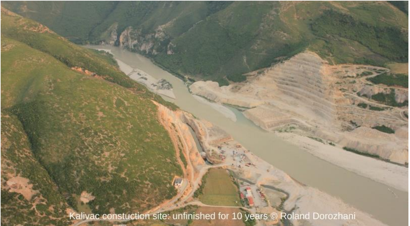
Kalivac construction site: unfinished for 10 years

HPP Kalivaç revisited: For almost 10 years, the construction of the dam project Kalivaç has been halted, but now it shall be continued. The Albanian Ministry of Energy and Industry has cancelled the contract with the Italian Company Kalivaçi Green Energy only to open the procedures for re-issuing the concession shortly after. We are considering legal actions. MORE