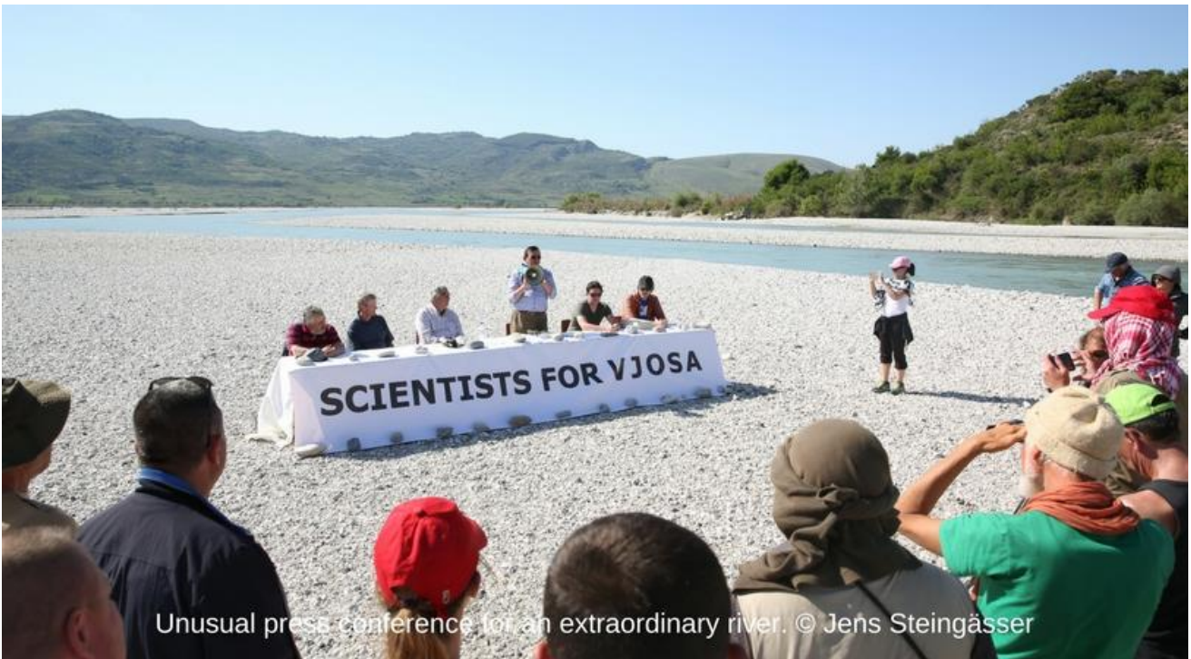
Unusual press conference for an extraordinary river.

HPP Kalivaç revisited: For almost 10 years, the construction of the dam project Kalivaç has been halted, but now it shall be continued. The Albanian Ministry of Energy and Industry has cancelled the contract with the Italian Company Kalivaçi Green Energy only to open the procedures for re-issuing the concession shortly after. We are considering legal actions. MORE