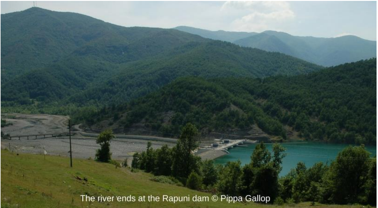
The river ends at the Rapuni dam

Bankwatch Blogs: Our partners from Bankwatch are reporting about the grievances in relation to the development of hydropower in the Balkans. Read about local communities putting up a fight against a dam which is threatening important fish habitats in BiH. Learn more about the Rapuni dam in central Albania, which led to dire consequences for residents; or about the fact that HPPs are popping up in Albania like bunkers in Hoxha's time – with little regard for people and nature.