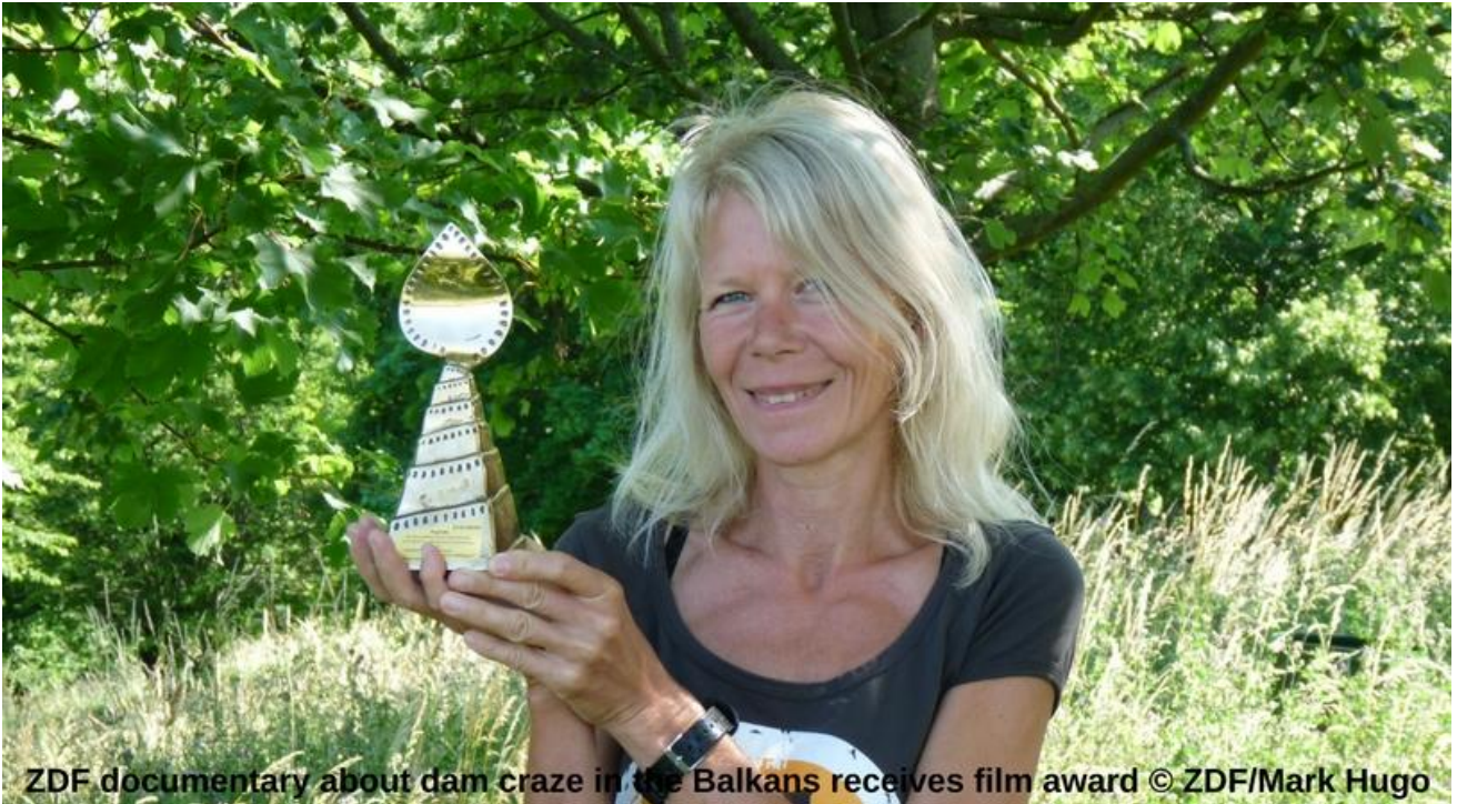
ZDF documentary about dam craze in the Balkans receives film award