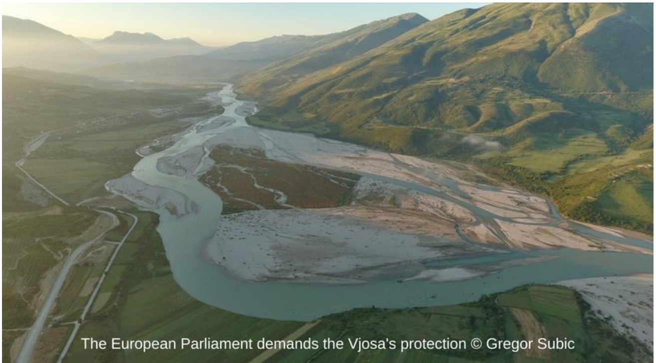
The European Parliament demands the Vjosa's protection

In the current Enlargement Report on Albania, the EU has once more criticized Albania's hydropower policy and also called for adjusting the quality of environmental assessments to EU standards ... MORE .