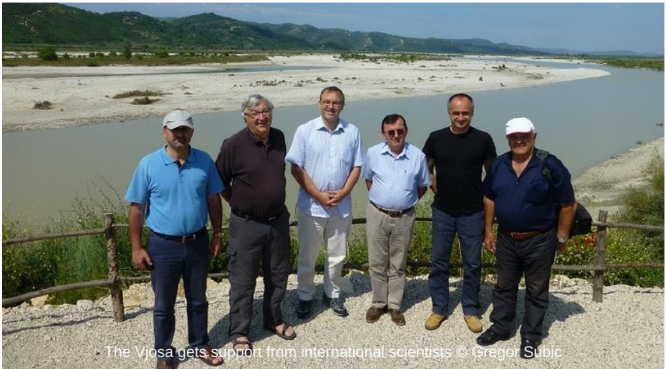
The Vjosa gets support from international scientists

Renowned scientists confirm: Environmental assessment for Vjosa hydropower project is a farce! In our fight to save the Vjosa we get support from the international science community who criticized the Poçëm EIA in a letter to the Albanian Prime Minister .... MORE