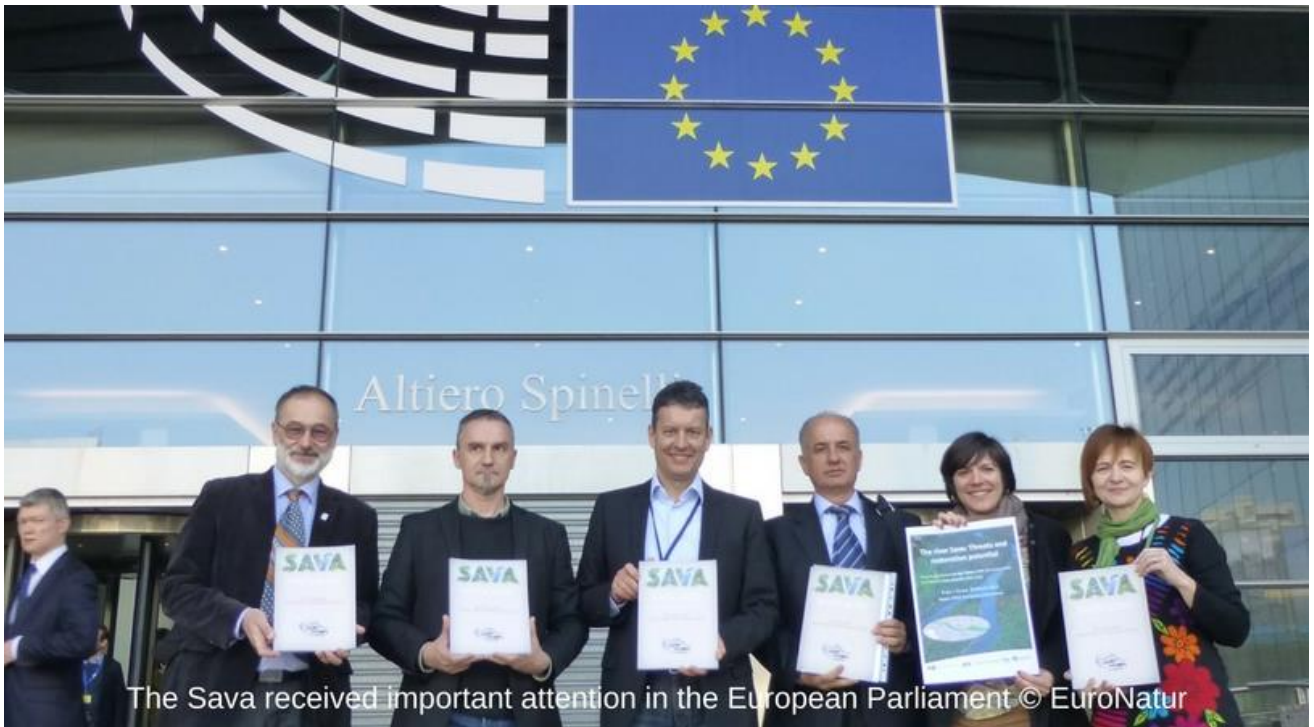
The Sava received important attention in the European Parliament

European Parliament discusses Sava River! The presentation of the Sava White Book in Brussels provided the opportunity to draw valuable attention to the river on EU level... MORE