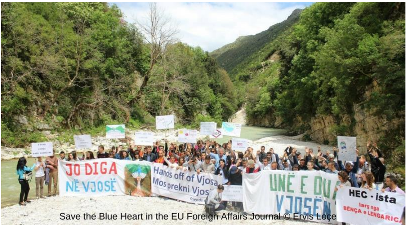
Save the Blue Heart in the EU Foreign Affairs Journal

In the European Union Foreign Affairs Journal N°1-2017, seventeen pages are dedicated to the Balkan Rivers (page 99-116). This gives us good exposure as the journal is widely followed by Members of European Parliament.... CHECK IT OUT