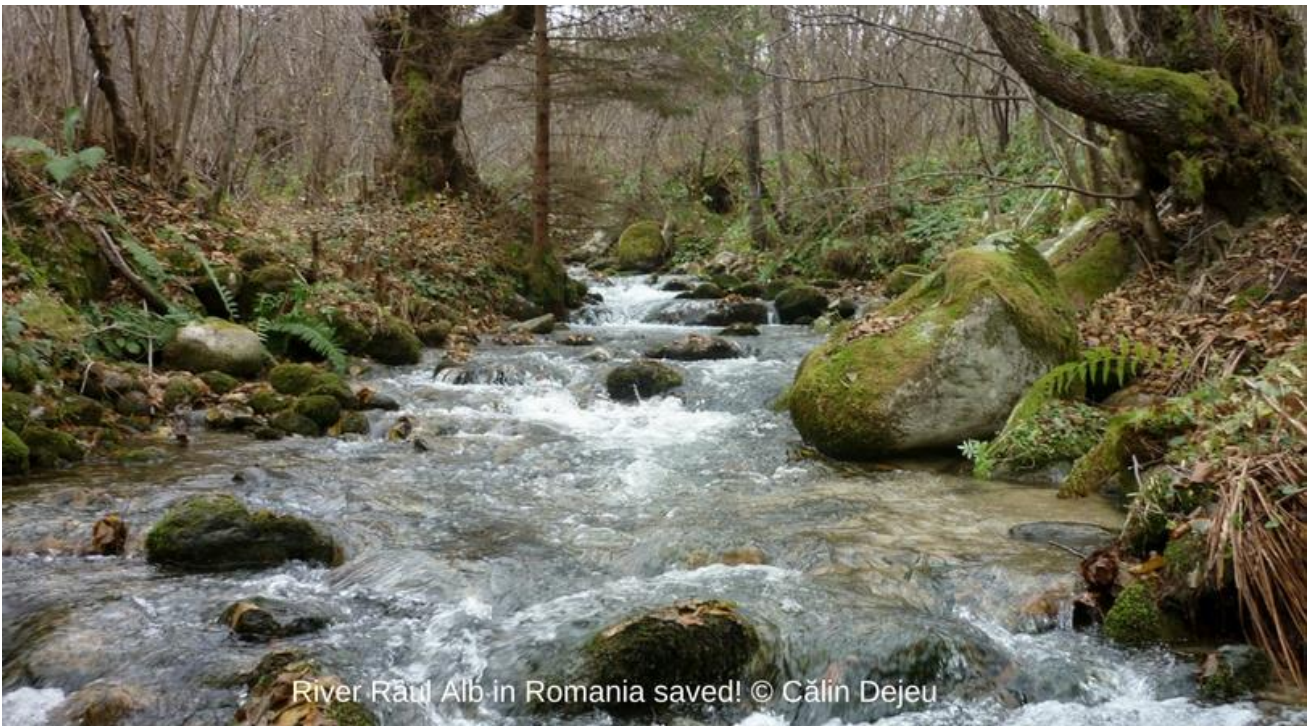
River Raul Alb in Romania saved!

Save Skadar Lake in Montenegro! Act now: please sign this petition by our Montenegrin colleagues at NGO Green Home to save an ecological treasure – Skadar Lake in Montenegro – from devastating construction. .... THANK YOU (scroll down for English)