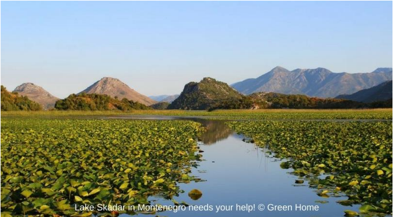
Lake Skadar in Montenegro needs your help!

Save Skadar Lake in Montenegro! Act now: please sign this petition by our Montenegrin colleagues at NGO Green Home to save an ecological treasure – Skadar Lake in Montenegro – from devastating construction. .... THANK YOU (scroll down for English)