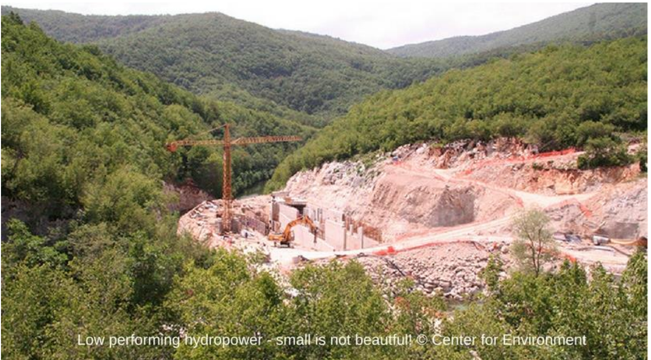
Low performing hydropower - small is not beautiful!

Small is not beautiful: small hydro development in the Western Balkans! This article in Balkan Green Energy News uncovers the myths about low performing dams: for a negligible amount of energy, these plants come at a high environmental cost and are often constructed in protected areas.... READ