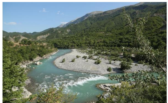
The Vjosa, still flowing unobstructed.

After telling the Blue Heart Team personally in spring that he supports our vision of a Vjosa National Park, PM Edi Rama is now planning to finalize the disputed Kalivac project along with another project downstream and more on its tributaries. We will do everything to stop these plans and to initiate Europe's first Wildriver National Park instead.