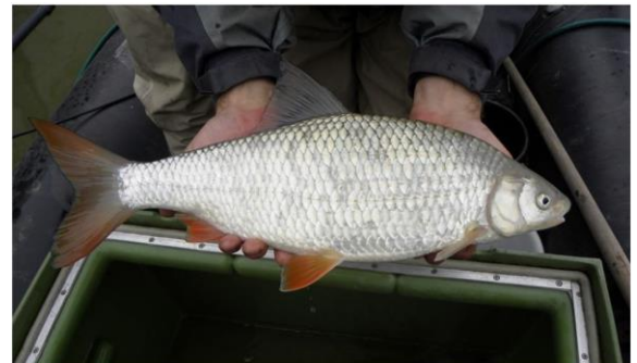
The endangered Danube Roach ( Rutilus virgo) would lose its spawning ground if Mokrice was built.

After telling the Blue Heart Team personally in spring that he supports our vision of a Vjosa National Park, PM Edi Rama is now planning to finalize the disputed Kalivac project along with another project downstream and more on its tributaries. We will do everything to stop these plans and to initiate Europe's first Wildriver National Park instead.