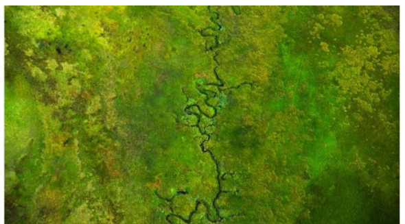
Hope for Lukovo Polje? This landscape could be saved.

After they conducted a fact-finding mission in Mavrovo NP, Macedonia, the Bern Convention's standing committee calls for a halt to hydropower development within the park. The EBRD and World Bank are asked to withdraw their funding of projects. More