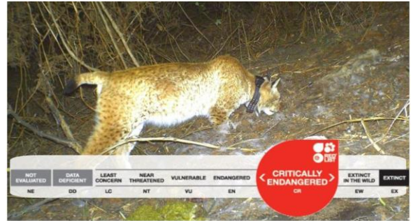
Mavrovo NP is home to the last known reproducing population of the critically endangered Balkan Lynx

In November, the Balkan Lynx was recognized as subspecies of the Eurasian Lynx and officially added to the IUCN Red List of Threatened Species . The Mavrovo National Park is the only confirmed breeding ground of this critically endangered cat. More