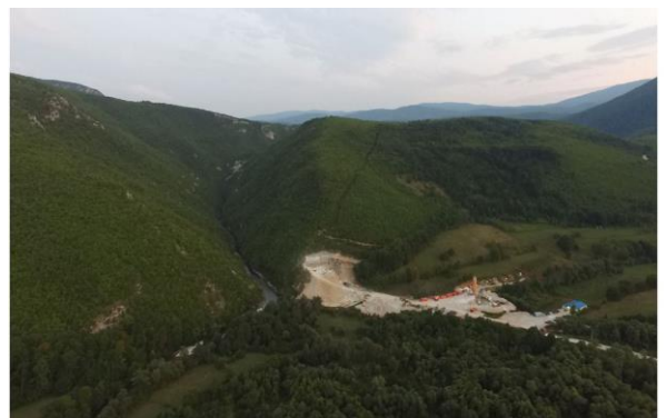
Medna project on Sana river, constructed by Kelag company.

Media coverage: Fena , Buka , Front Slobode , BN TV