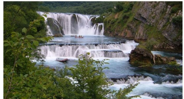
Štrbački Buk, the famous waterfall on the Una River

Good news: responding to the public pressure, the Bihać City Council has stopped the construction of two small hydropower plants in the Una National Park in Bosnia and Herzegovina which would destroy one of the most magnificent rivers in the Sava River Basin. More