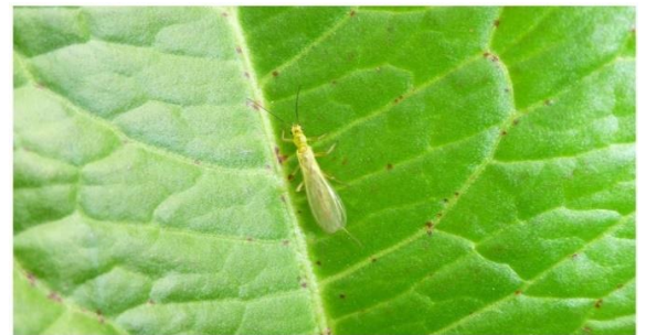
Photos of the newly discovered species do not yet exist. Here a similar stonefly species.

A team of scientists discovered three previously unknown caddisfly and stonefly species inside the Mavrovo National Park in Macedonia. The species are already at risk of extinction, since the Macedonian government plans the construction of 22 hydropower plants inside the park. This would affect also those creeks in which these species find habitat. More