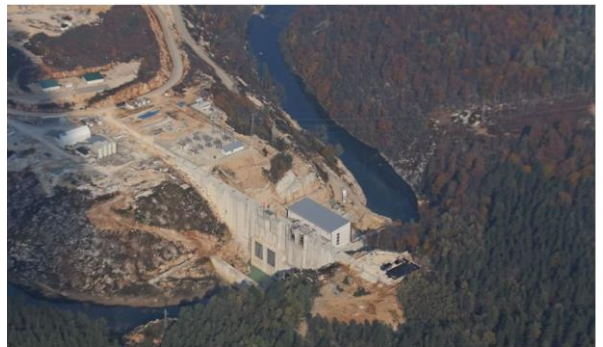
The Lesce hydropower plant on Croatia's river Dobra has caused numerous problems since its commissioning in 2010.

The Austrian-German energy company is constructing a hydropower plant on the Sana River (Bosnia-Herzegovina), which is one of the six most important rivers for the globally threatened fish species. While Kelag is destroying one of the healthiest Huchen occurrences on the Balkans, millions are spent to regenerate rare Huchen populations in Austria More